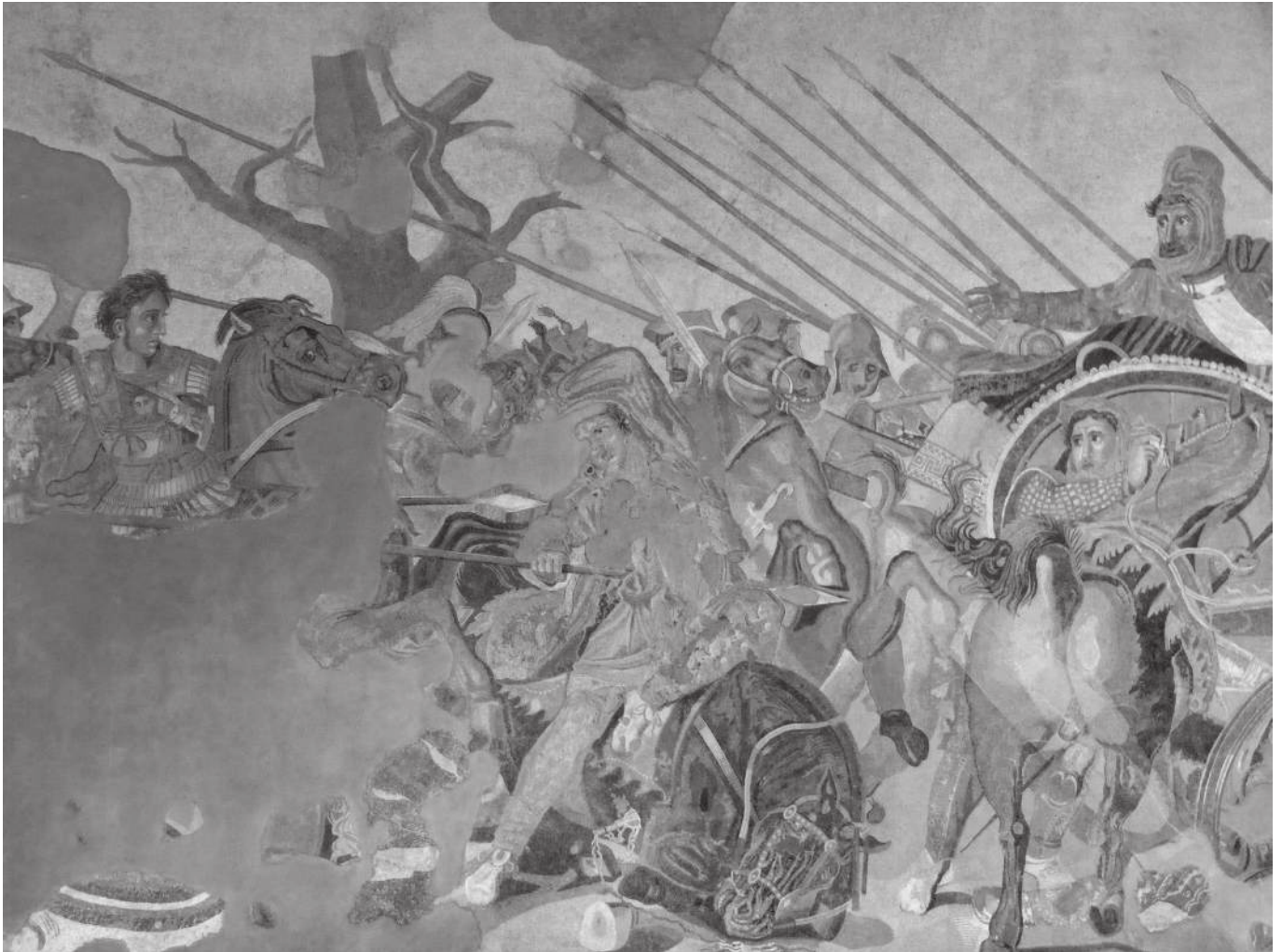
(Mosaic of Alexander at the Battle of Issus)

1 Study the image and answer the questions: